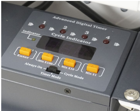
Details of the rear compartment Cable winder | Power sockets | Control unit