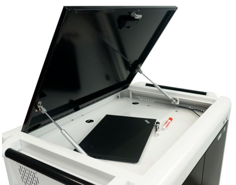
External details of the product Handle | Front lock | Upper compartment