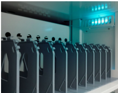
Internal details and sterilizer Fully detachable and modular plastic partitions | Front activation button | 3 UV lamps