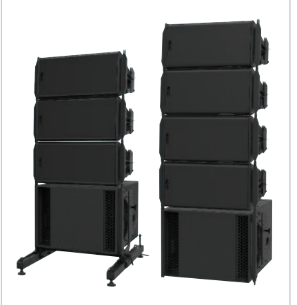
LS18 anchoring a GEO S12 ground stack.

LS18 shown pole-mounting a PS15 cabinet (left) and flown in a GEO S12 line array (right).